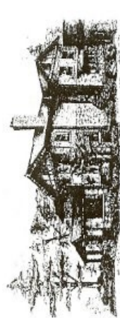
The Stone House Bed & Breakfast 405 West Broad Street Chesaning, MI 48616

Totally Smoke Free for Your Safety & Enjoyment!